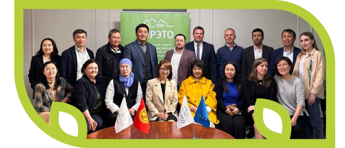
PERETO has organised a study tour in Europe for PERETO policy stakeholders to explore sustainable tourism policy and best practices for businesses

PERETO has developed a methodology for piloting a voluntary eco-certification and ECO-KG labeling for HoReCa